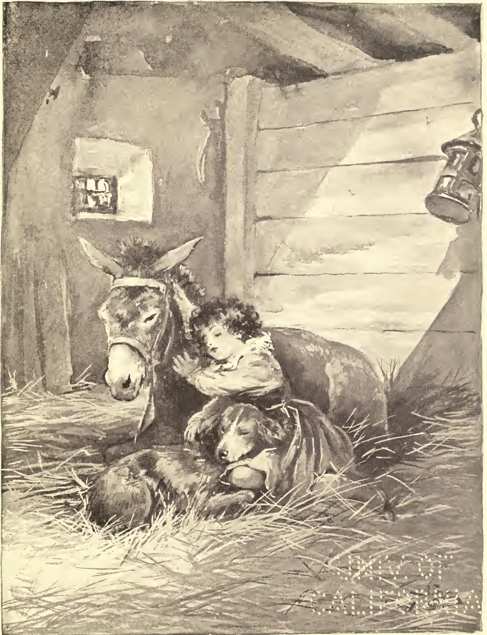
“PICCINO, WHO LAY FAST ASLEEP”